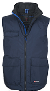
NAVY DRESS BLUE/ROYAL BLUE