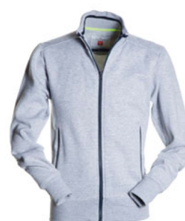
MELANGE GREY/NAVY BLUE