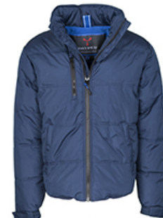
NAVY DRESS BLUE