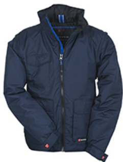
NAVY DRESS BLUE/ROYAL BLUE