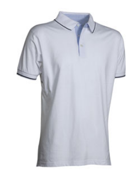
WHITE/NAVY BLUE ORANGE/WHITE