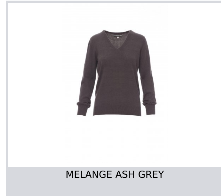
MELANGE ASH GREY