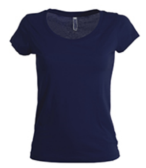
SEAPORT NAVY BLUE